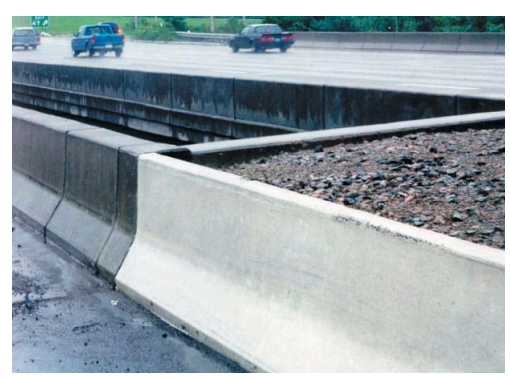
New Jersey Barriers are often made of grey concrete.

New Jersey Barriers are a much used barrier type for traffic regulation. They are often made of grey concrete. New Jersey Barriers based on