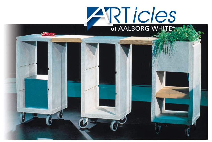
Mobile kitchen constructed using AALBORG WHITE® cement.

The brochures can be ordered via the web site www.aalborg-portland.dk