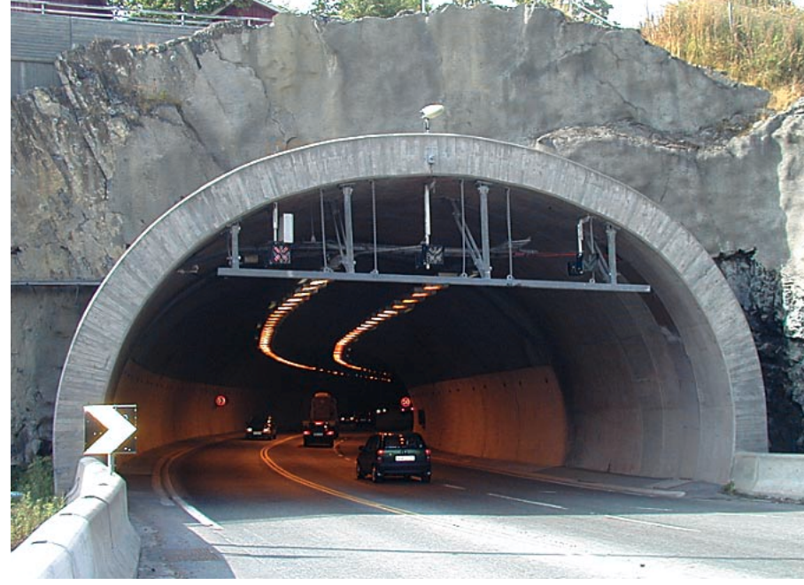
Greater reflection in the tunnel improves road safety.

AALBORG WHITE® cement give an ideal combination of high strength and high reflection. The high reflection comes into prominence especially during darkness or in rain, as can be seen in the photograph taken in the USA.